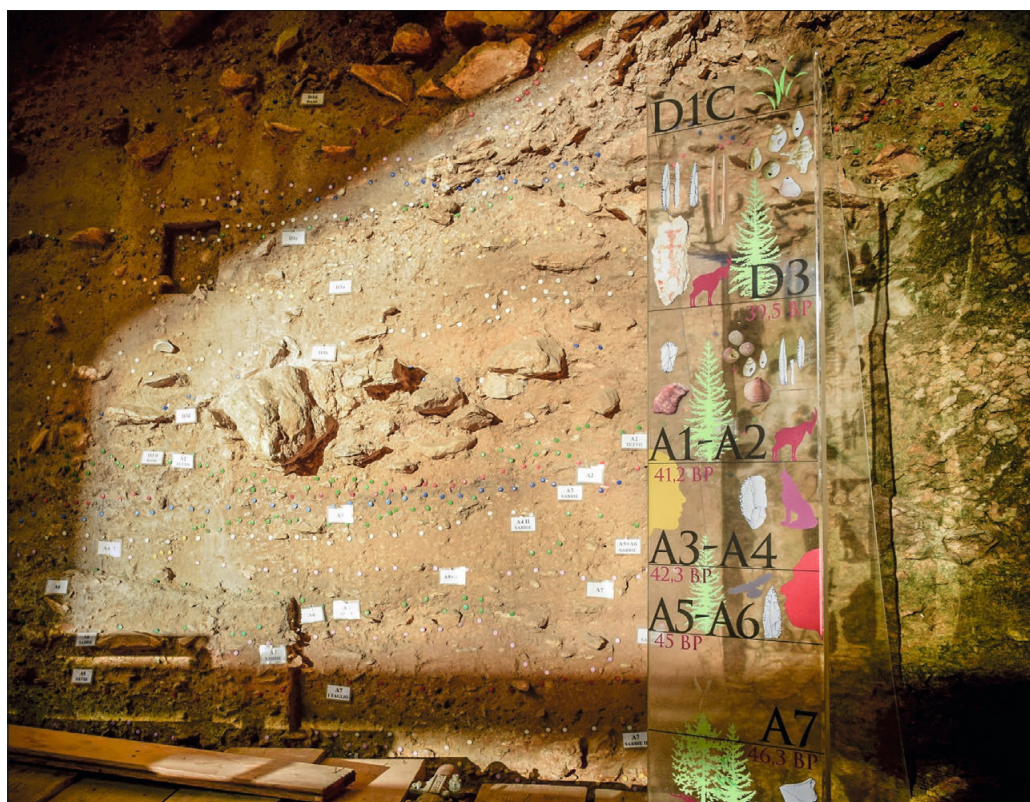
Fig. 1: Fumane Cave. The stratigraphic sequence at the entrance of tunnel A with evidence of late Mousterian (A6–A5), Uluzzian (A4–A3) and Protoaurignacian layers (A2–D3).

phases mostly caused by freezing and thawing. Details about the stratigraphic sequence, paleoclimatic significance, as well as paleontological and cultural content, are available in numerous publications (Bartolomei et al. 1994; Cassoli and Tagliacozzo 1994; Broglio et al. 2003, 2005; Broglio and Dalmeri 2005; Higham et al. 2009; Peresani 2012; Benazzi et al. 2015; López-García et al. 2015; Peresani et al. 2016; Falcucci et al. 2017). A main cave and two associated tunnels preserve a finely-layered sedimentary succession spanning the late Middle Paleolithic and the Early Upper Paleolithic (Fig. 1), with features and dense scatters of remains in units A11, A10, A9, and A6–A5 (Mousterian: Peresani 2012; Peresani et al. 2013), A4 and A3 (Uluzzian: Peresani et al. 2016), A2–A1 (Protoaurignacian: Broglio et al. 2005; Bertola et al. 2013; Cavallo et al. 2017; Falcucci et al. 2017, 2018; Falcucci and Peresani 2018), D6, D3, and D1c (Aurignacian sensu lato: Broglio and Dalmeri 2005), and D1d (Gravettian: Bartolomei et al. 1992). Currently, layers have been extensively excavated at the entrance of the cave and partly excavated in the cave mouth.