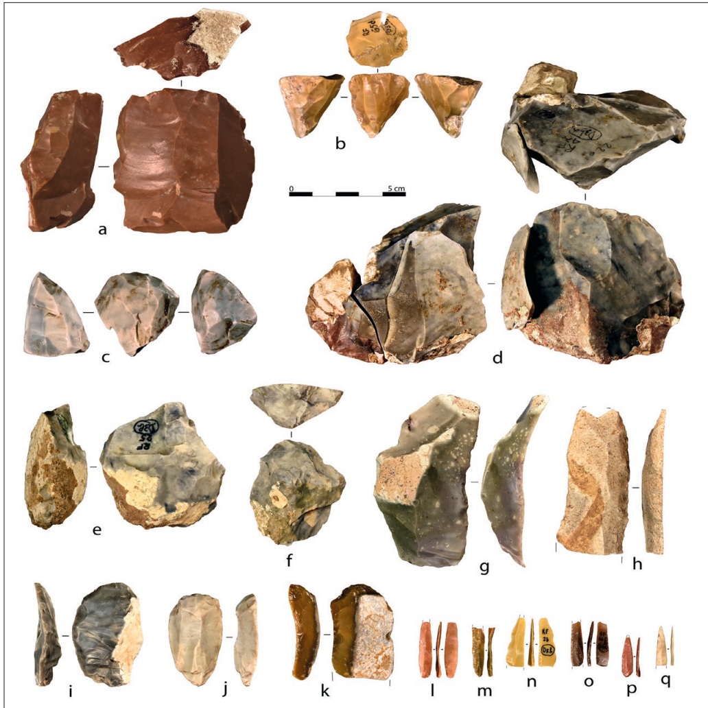
Fig. 5: Fumane Cave. Selection of cores and tools from the youngest cultural phase D3balpha–D3ab. Wide-faced flat blade core (a), semi-circumferential bladelet core (b), multi-platform bladelet core with evidence of both carinated and narrow-sided reduction strategies (c), partially refitted initial semi-circumferential blade core (d), unidirectional platform flake core (e), carinated endscraper (f), laterally-retouched blade (g), Aurignacian blade (h), endscrapers on flake (i–j), endscraper on blade (k), bladelets with lateral retouch (l–o), and bladelets with convergent retouch (p–q). D3balpha = d, g, j, l, o–q; D3ab = a–c, e–f, h–i, k, m–n.

Abb. 5: Fumane-Höhle. Auswahl an Kernen und Werkzeugen aus der jüngsten Kulturphase D3balpha–D3ab. Flacher Klingenkern mit breiter Abbaufäche (a), halbumlaufernder Lamellenkern (b), Lamellenkern mit mehreren Schlagflächen, der Hinweise auf Grundformgewinnung sowohl nach der Abbaustrategie an gekielten Stücken als auch Abbau an der Schmalseite des Kernes zeigt (c), teilweise zusammengesetzter halbumlaufernder Klingenkern im Anfangsstadium (d), unidirektionaler Plattform-Abschlagkern (e), Kielkratzer (f), lateralretuschierte Klinge (g), Klinge mit Aurignacienretusche (h), Abschlagkratzer (i–j), Klingenkratzer (k), Lamellen mit Lateralretusche (l–o) und Lamellen mit konvergierender Retusche (p–q). D3balpha = d, g, j, l, o–q; D3ab = a–c, e–f, h–i, k, m–n.