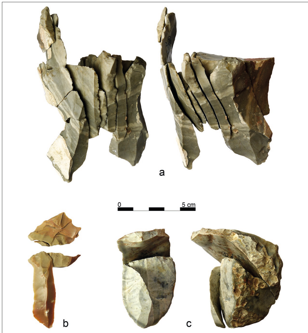
Fig. 2: Fumane Cave. Examples of refitted artifacts from unit A2. Refitted semi-circumferential blade core (a), small blade refitted to a core tablet (b), and narrow-sided bladelet core with refitted core tablet and plunging technical flake (c).

the main reduction processes used by knappers. Details on this method and information about the graphic criteria used to produce schematic drawings of cores and blanks can be found in Falcucci and Peresani (2018).